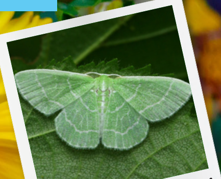
Wavy-lined Emerald Moth