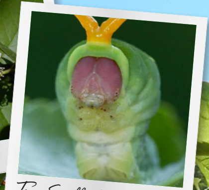
Tiger Swallowtail Caterpillar