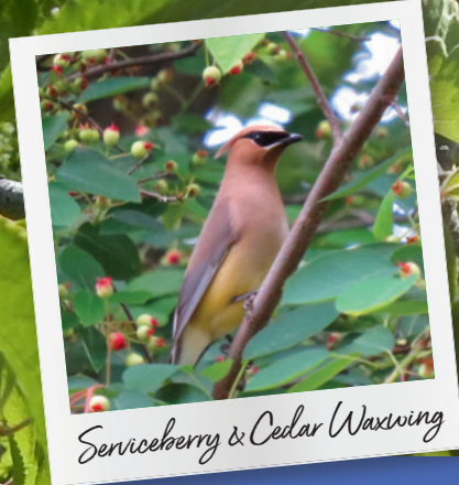
Serviceberry & Cedar Waxwing