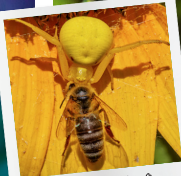
Crab Spider & Sunflower

Left: Zig-Zag Goldenrod ( Solidago flexicaulis ) Zig-Zag Goldenrod flowerheads are pollinated by many species of insects, and many more insects eat the leaves, flowers, seeds, and roots. The Zig-Zag Goldenrod supports 97 caterpillar species, including the Wavy-Lined Emerald Moth , and 56 specialist bee species.