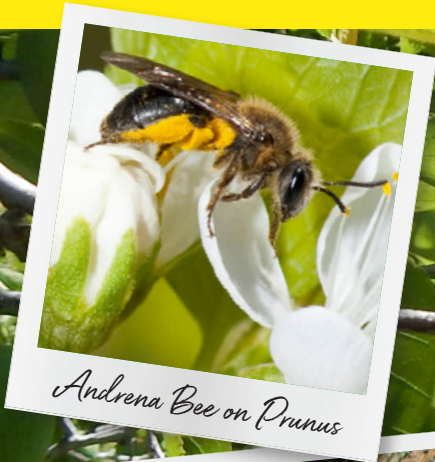
Andrena Bee on Prunus