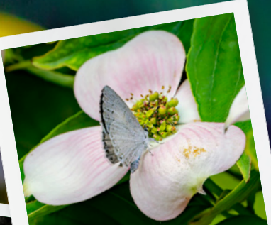
Spring Azure on Dogwood