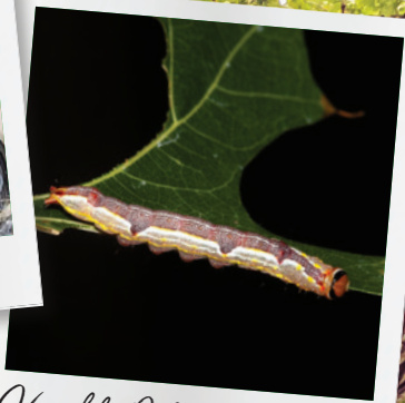
Variable Oakleaf Caterpillar