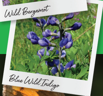
Blue Wild Indigo