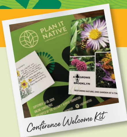
Conference Welcome Kit

97.6% of conference attendees report that Plan It Native improved their native plant landscaping practices.