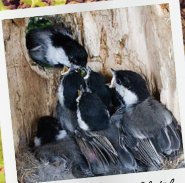
Chickadee Feeding Clutch

Planting an oak tree along with other native plant species supports local habitat and maintains biodiversity.