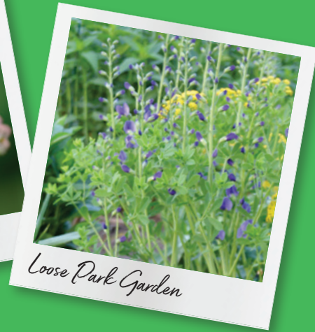
Loose Park Garden