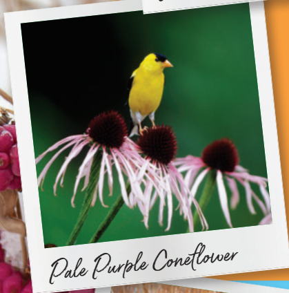
Pale Purple Coneflower